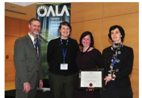
Honour Award recipients for PLANT Architect Inc.

• An Honour Award – to Claude Cormier Architectes Paysagistes inc. with The Planning Partnership for Canada's Sugar Beach (Toronto).