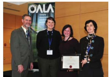
Honour Award recipients for PLANT Architect Inc.

• An Honour Award – to Claude Cormier Architectes Paysagistes inc. with The Planning Partnership for Canada's Sugar Beach (Toronto).