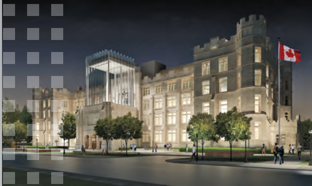
Canadian Museum of Nature

Ontario Association of Landscape Architects